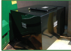
350 Gallon Vats

Or: We can pump directly from your tank.