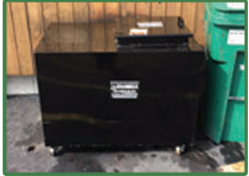
175 Gallon Vats